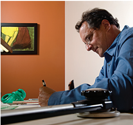
Technical design & engineering services

We're fully-qualified and highly experienced rigging specialists, with unsurpassed technical expertise in all rigging categories, products, and markets – from the ports to the oilfields.